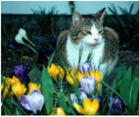
Protect your indoor/outdoor cat with the FIV vaccine

Did you know that one in twelve cats in the United States tests positive for Feline AIDS?