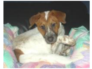
Shelby—currently up for adoption through New England Dog Lift

New England Dog Lift is an all volunteer run organization that completely relies on foster homes to care for the dogs before they are adopted. They are always looking for additional foster homes. Please check out their website for more information at www.newenglanddoglift.com