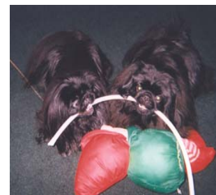
Mike and Ike: MVH's regular grooming clients

Our grooming services have proven successful so we are currently looking to expand the services. In the future, we look forward to offering you and your pet more during their pampering here at MVH.